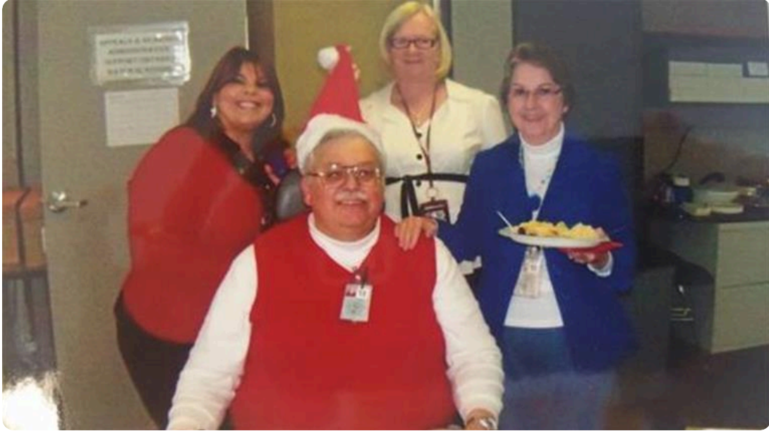
Christmas Lunch 2013 @ 9th Floor