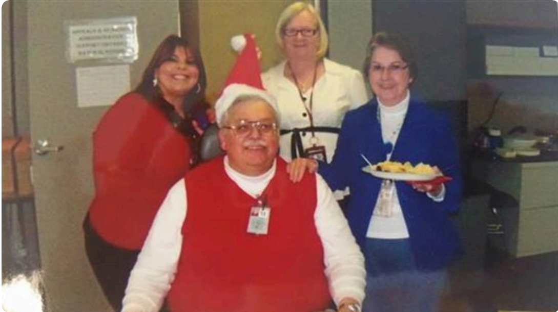
Christmas Lunch 2013 @ 9th Floor